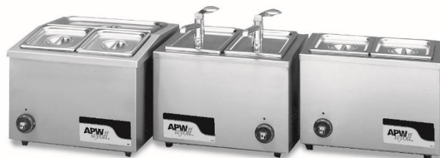
Pumps & lids by others