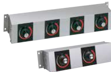
RMB-14E with infinite controls