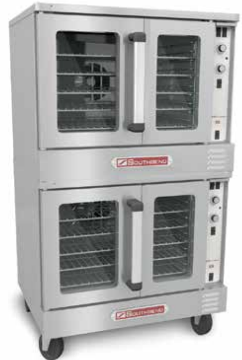
(SLES/20SC shown with optional casters)

SLES/20SC, SLES/20CCH SLEB/20SC, SLEB/20CCH