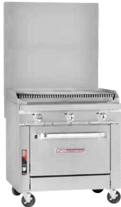
P36D-CCC w/ optional casters and flue riser.