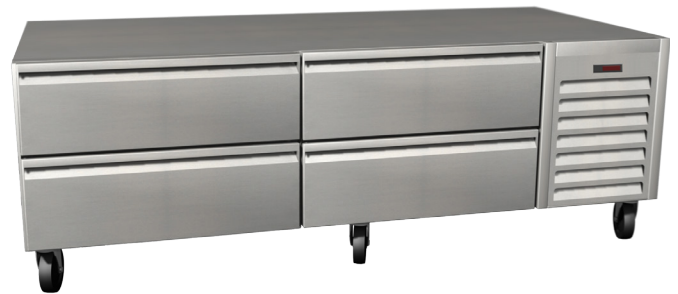
(Model 30072SB with optional casters)

30032SB (32" wide); 30036SB (36" wide); 30048SB (48" wide); 30060SB (60" wide); 30064SB (64" wide); 30072SB (72" wide); 30084SB (84" wide); 30096SB (96" wide); 30108SB (108" wide); 30120SB (120" wide)