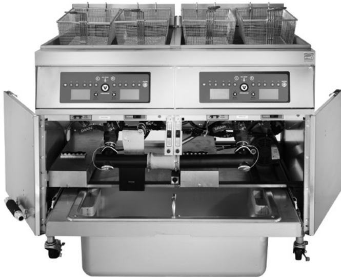
Model 2ER85CF Shown on casters (Accessory)