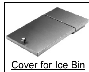
Cover for Ice Bin