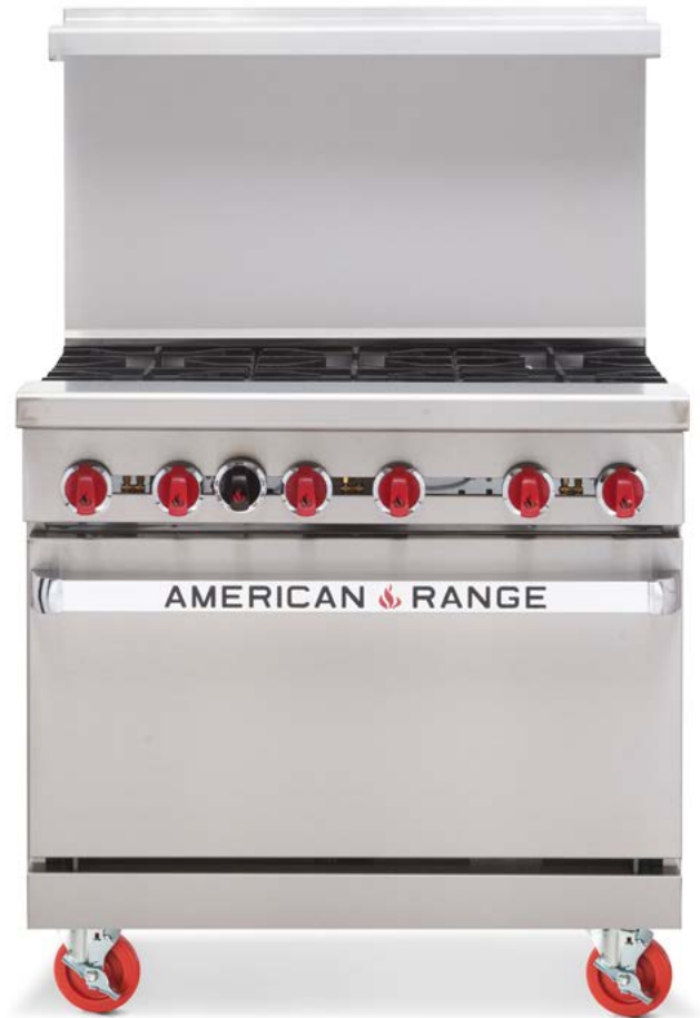
Model ARW36-6 Shown with optional oven and casters.

The Heavy Duty Restaurant Range Series by American Range was designed for continuous rugged use and performance. All the latest technology is incorporated to give you the best value for your money.