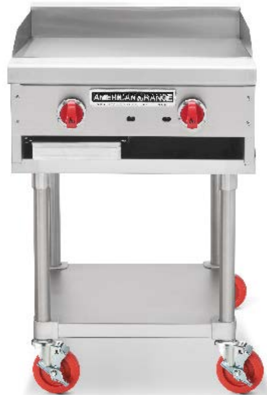
Model ACCG-24 shown with option stand and caster.

American Range ACCG series concession griddles are design engineered to provide the ultimate in performance and durability. The compact design saves counter space while allowing griddle operation. As with all of our heavy duty countertop equipment, they are built to the highest commercial standards to ensure years of trouble free service, featuring superior frame construction and Stainless Steel exterior for easy maintenance. Combine all of this and our affordable prices and you have the best value for your budget.