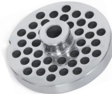
2 Plates Included (6mm & 8mm) Additional Accessories Available Upon Request