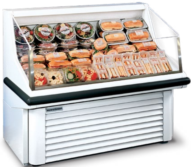
Model shown with optional 3-sided bumper kit.