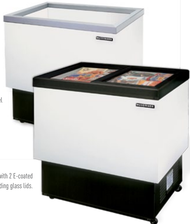
SN model shown with 2 E-coated tempered sliding glass lids.