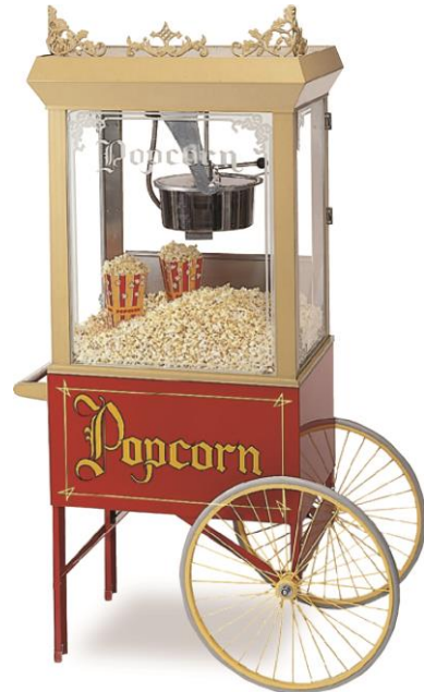
Popper shown on Cart 2015 for reference only (cart sold separately).