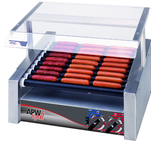
Model: HRS-31S Roller Grill with SGXP-31 Sneeze Guard