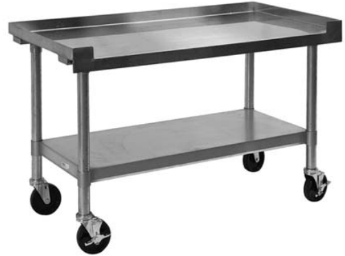
Medium Duty Cookline Stand