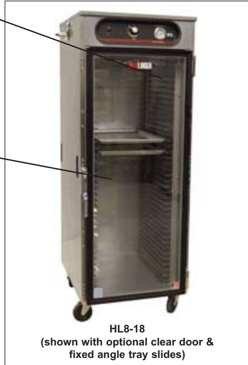
HL8-18 (shown with optional clear door & fixed angle tray slides)

EASY-TO-USE DIGITAL CONTROLS... Control heat with dial. Temperature range of 85°F to 200°F. Flashing display during preheat mode, turns solid when preheat mode is complete. Temperature display shows user setting. Press temperature dial to display actual temperature. Low temperature light with audible alarm.