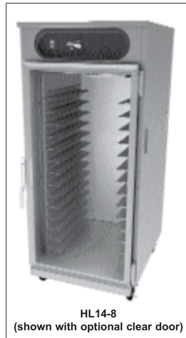
HL14-8 (shown with optional clear door)

1551 McCormick Avenue, Mundelein, Illinois 60060 Tel. (847)362-5500 • (800)323-9793 • Fax (847)367-8981 www.carter-hoffmann.com