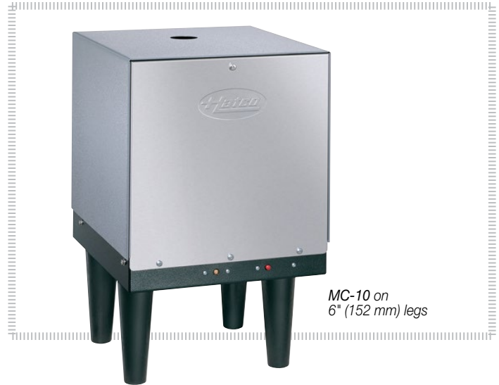
MC-10 on 6" (152 mm) legs