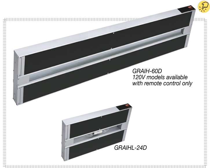
GRAIH-60D 120V models available with remote control only