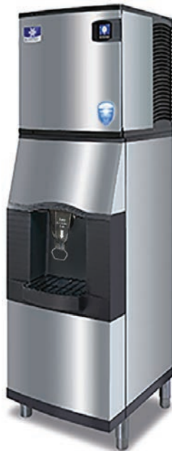
Indigo NXT iT0620 Ice Machine SPA-162 Ice Dispenser (Ice Machine and Dispenser sold separately)

Coupled with an Indigo NXT ice machine, you can program the ice machine to be off at night so that while the hotel guests are sleeping, the ice machine can be too!