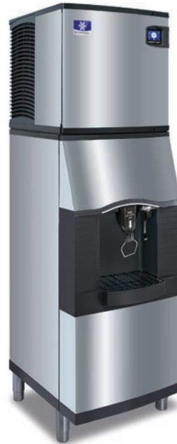
Indigo NXT iT0620 Ice Machine SFA-192 Ice & Water Dispenser (Ice Machine and Dispenser sold separately)