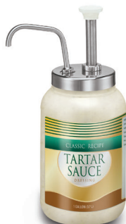
CP-G 110 mm 83120