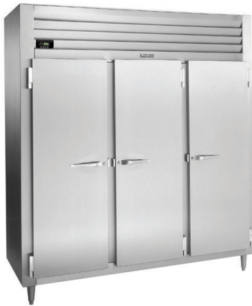
Model Shown Three Section