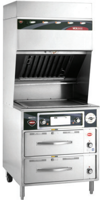
Model WVG136RW SHOWN