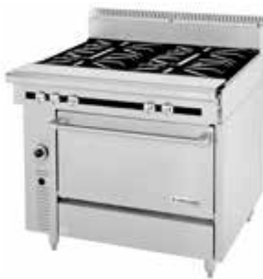
Model C836-7 Range with Four Open Burners