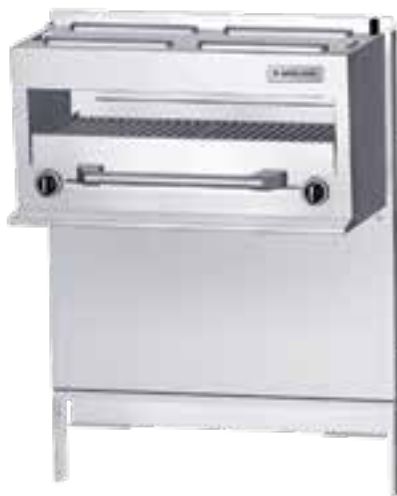
Model GFIR36M Infra-Red Broilers With Pull Out Broiling Rack