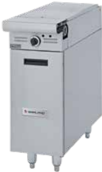
Model M6S 17" Range Attachment With Even Heat Hot Top