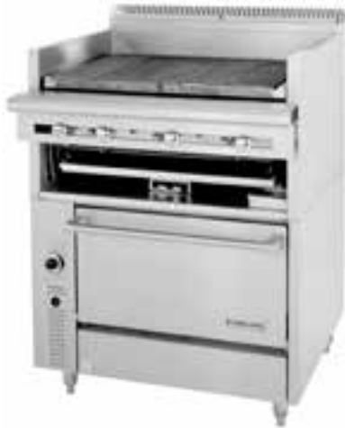
Model C836-436A Char-Broiler With Adjustable Racks – Briquettes Or Radiants