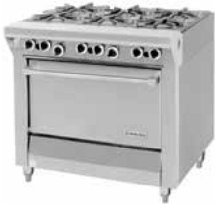
Model MST43R (valve control panel not as depicted) Range With Six Open Star Burners