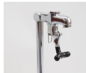
Optional Glass Filler Faucet