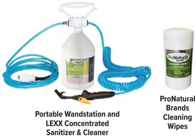
Portable Wandstation and LEXX Concentrated Sanitizer & Cleaner