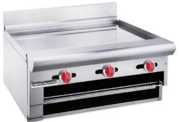
Model Shown ARGB-36