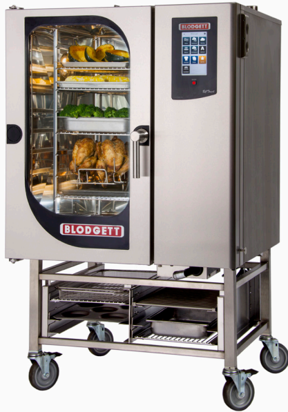
Shown on optional stand with casters